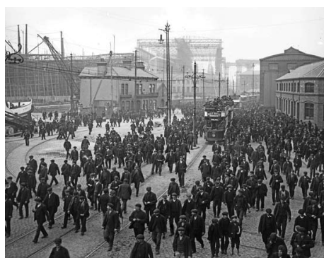
The Titanic in the background, workers leaving to go home Ulster Folk and Transport Museum

to use different sources to reach conclusions about these men from the past; to understand the impact that these people have made; to increase their vocabulary; to participate in a group discussion; to improvise a scene.