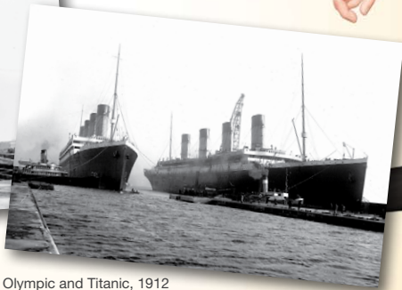
Olympic and Titanic, 1912