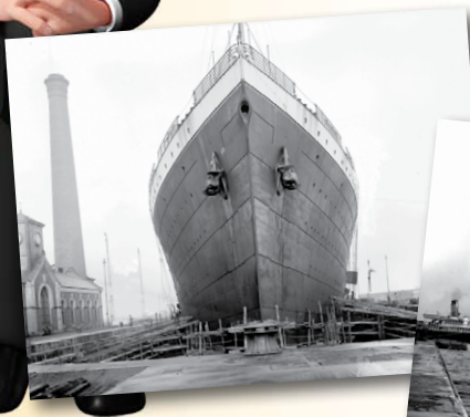
Olympic liner in the Dry-Dock Ulster Folk and Transport Museum